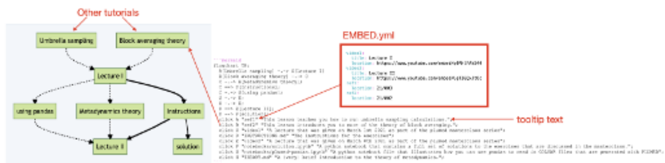
Figure 1: An example of one of the graphs that show students how to work through a tutorial from our website and the markdown and yml text that is used to construct it. As discussed in the text, when students hover over the green squares in the graph a tooltip appears that provides more detail on the resource that will open when they click on the square. Instructions for creating the graph should be written in the NAVIGATION.md file in the Mermaid syntax that is shown on the right of figure. If contributors want to include links to other tutorials on our site or external websites and videos they should include these links in an EMBED.yml file that is similar to the one shown here.

black solid line to indicate the path through the essential resources and dashed lines to indicate any supplementary resources that were provided. However, contributors also write a short paragraph of text on the landing page that explains the tutorial so they can choose to use line types in their graph in whatever way they feel is appropriate and describe their chosen approach.