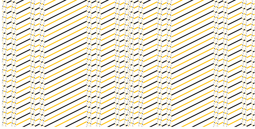
FIGURE 1. Curves satisfying \dot{\gamma}(s) = 1 almost everywhere might fail to be Lipschitz continuous: characteristic curves are indeed required to be absolutely continuous. Absolute continuity automatically improves to C^1 -regularity, due to the continuity of the field. They are then stable under uniform convergence.

Notice that i_\gamma is an integral curve of the vector field (1, \lambda) .